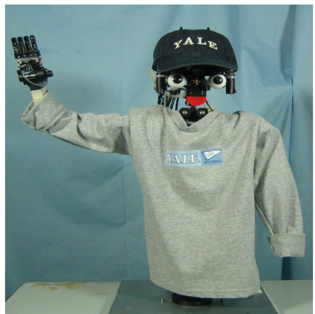
Fig. 2. The upper-torso robot Nico inside the laboratory setup.

3) The Robot Nico : The robot used throughout this experiment was an anthropomorphic upper-torso robot designed with the proportions of a one-year old child, named Nico [14]. Although Nico's construction is not concealed, Nico has a friendly, non-threatening face. The robot wore a (child's) sweatshirt and baseball cap during the interactions (see Fig. 2). Nico's head has a total of seven degrees of